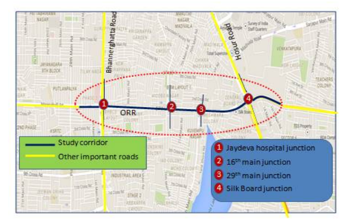
Fig. 2: Major Roads and Intersection along the Study Stretch